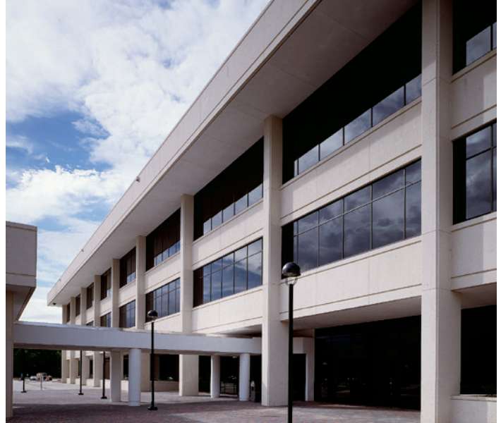
Customer Service Center, Blue Cross and Blue Shield of Louisiana Baton Rouge, Louisiana ARCHITECT Architectural Group of Baton Rouge, Baton Rouge, Louisiana GLAZING CONTRACTOR Louisiana Glass Company, Baton Rouge, Louisiana

The 1-3/4" (44.5 mm) minimal sightline provides consistent design aesthetics, while a 1-1/4" (31.75 mm) perimeter sightline is also available. Since the exterior face and interior mullions are separate pieces, two-color design considerations are easily realized.